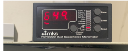
Pressure gage on top of vacuum chamber