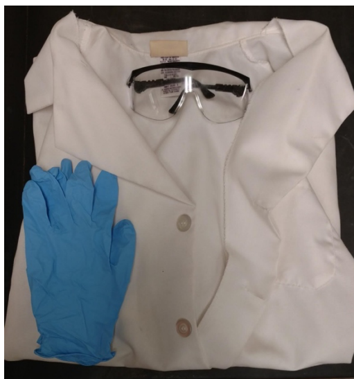
Personal protective equipment