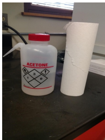
Acetone and paper towels