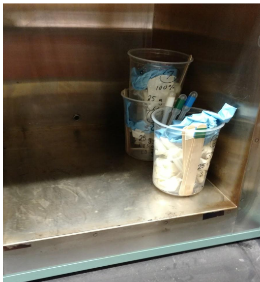
Trash in the curing oven