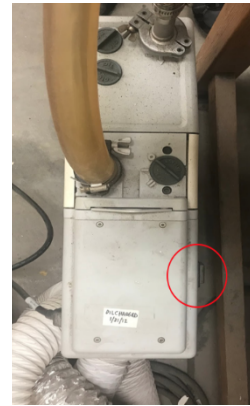
Vacuum Pump Switch