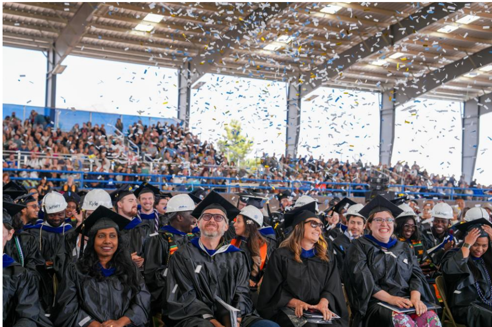
NMT 2024 graduation.