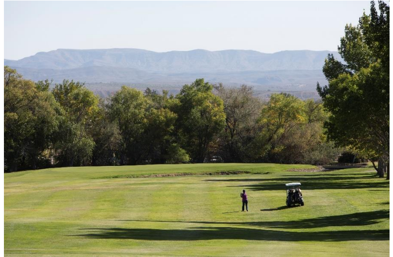
NMT's popular and beautiful golf course.

Nature lovers are drawn to Socorro and the surrounding area for its scenic beauty, fascinating wildlife, and outdoor recreation. During the winter, the Bosque del Apache National Wildlife Refuge is home to bald eagles and thousands of sandhill cranes and snow geese. Also, located just five miles from Socorro, Box Canyon is a popular site for camping, hiking, and rock climbing and attracts both locals and knowledgeable visitors.