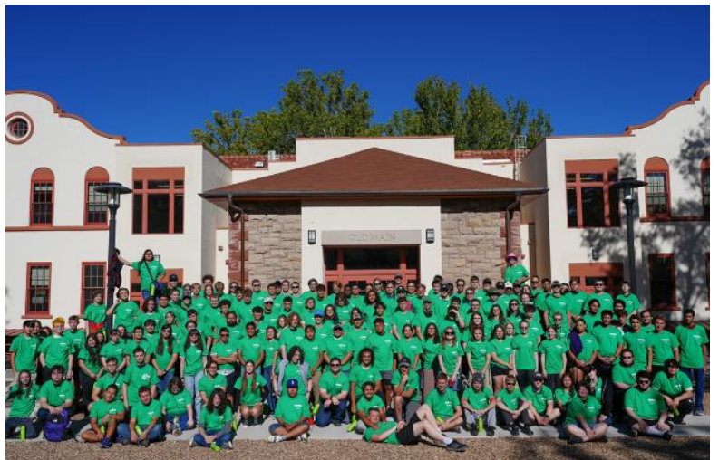
NMT Class of 2024 move-in weekend.